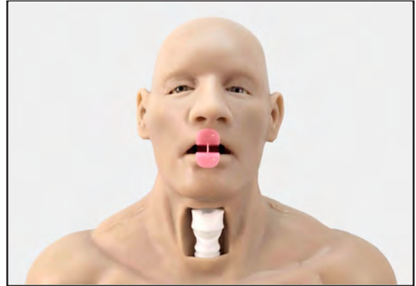
2. Clearing upper airway of obstructions (i.e. finger-sweep) with Oropharyngeal airway measurement and placement