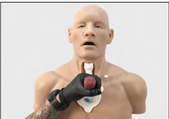
5. Sternal Intraosseous Catheter Insertion