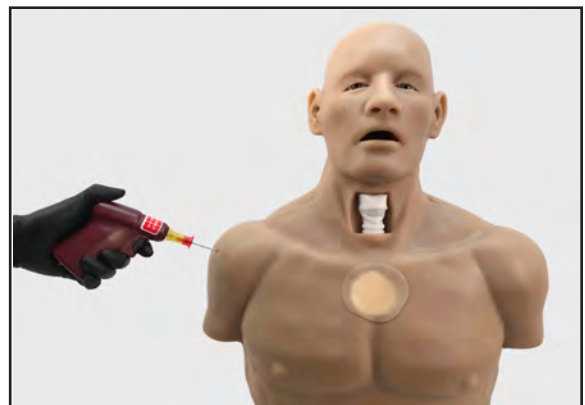
6. Proximal Humerus Intraosseous Catheter Insertion