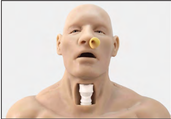
1. Nasopharyngeal Airway (NPA) Adjunct Insertion (with oropharyngeal visual confirmation of proper measurement and placement)