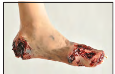
Partial Foot Amputation