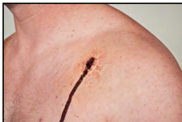
Gunshot Entrance Wound