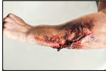
Forearm Laceration with Shrapnel