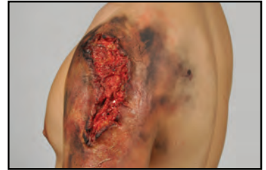
Upper Extremity 3rd Degree Burn