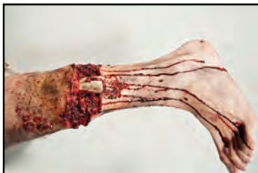
Compound Fibula Fracture