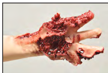
Partial Hand Amputation