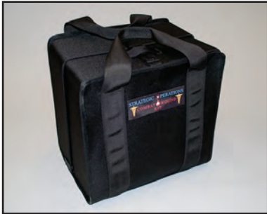
Custom Designed and Fabricated Carrying Case

The Hyper-Realistic Moulage Kit provides the capabilities of a professional Special Effects Make-up Artist in one highly versatile product. The HRMK inserts Hyper-Realism into any training revolution, increasing the stress inoculation factor for medical and non-medical professionals; greatly decreases the costs when implementing Hyper-Realistic™ casualties into training scenarios because everything is completely reusable. The HRMK is 100% user customizable enabling the order of specific "pages" with the desired wound patterns or types.