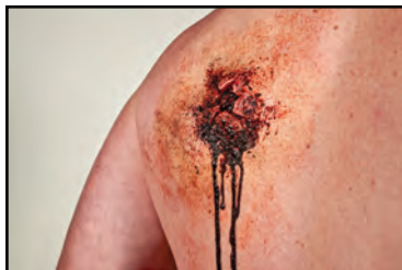
Gunshot Exit Wound