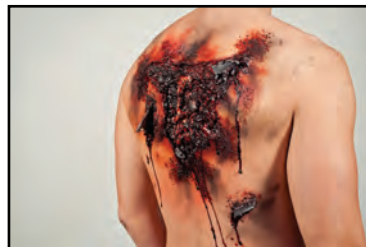
Penetrating Shrapnel Wounds