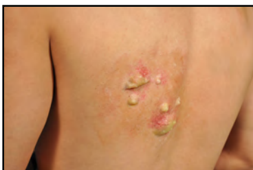
2nd Degree Partial Thickness Burn