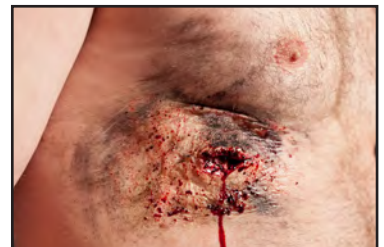
Sucking Chest Wound