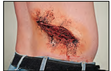
Superficial Large Laceration