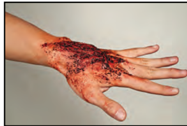
Dorsal Hand 1st & 2nd Degree Burns