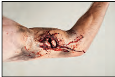
Compound Humerous Fracture