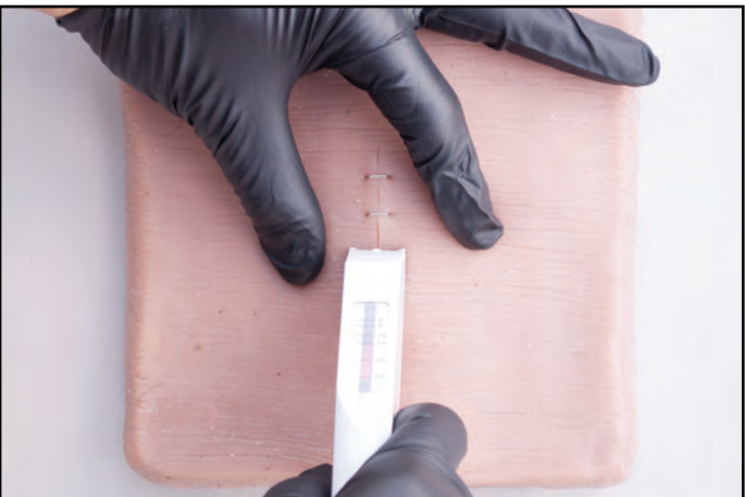
Complete staple repair of a laceration