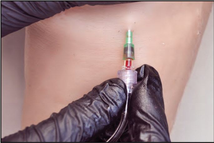
IV catheterization inducing fluid resuscitation.