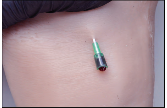
IV catheterization with blood flashback.