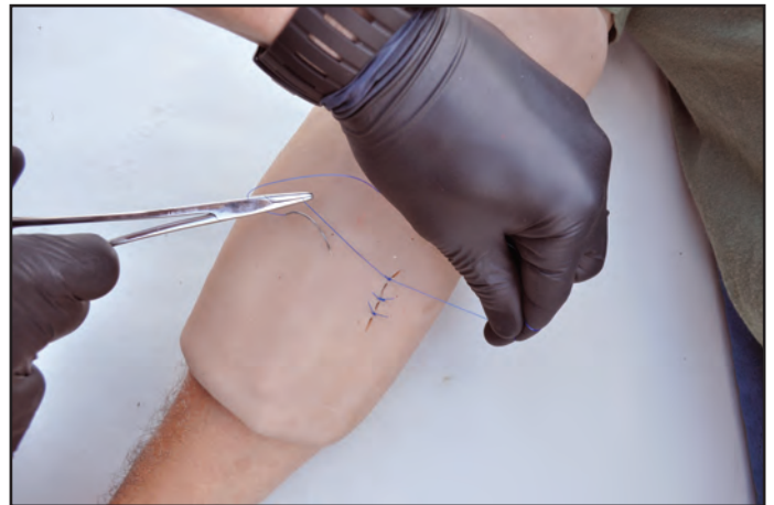
Complete suture repair of a laceration.