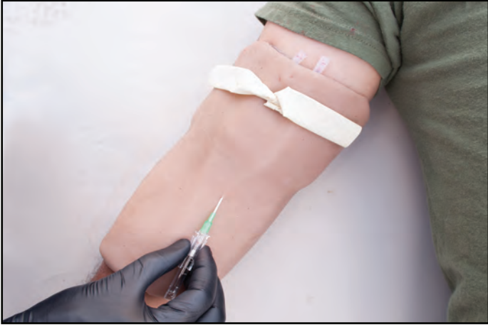
Proper IV insertion utilizing palpation technique to locate veins