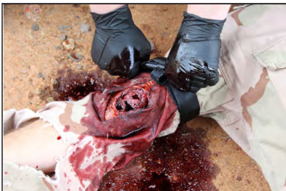
Tourniquet application to an upper extremity life threatening bleed