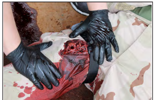
Tourniquet application to a lower extremity life threatening bleed