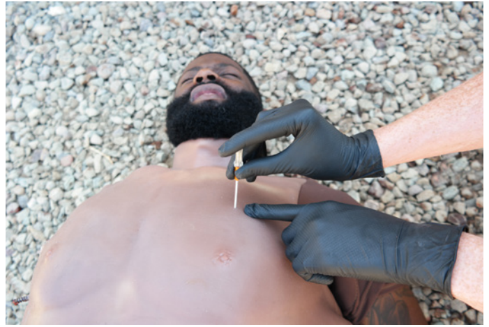
CHEST NEEDLE THORACENTESIS