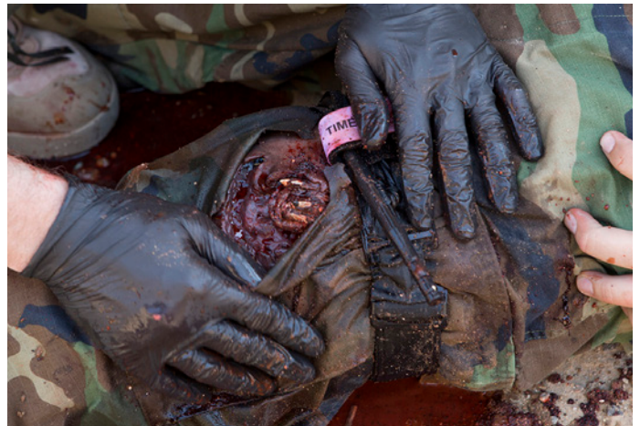
HEMORRHAGE CONTROL - LEG