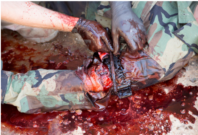
HEMORRHAGE CONTROL - ARM