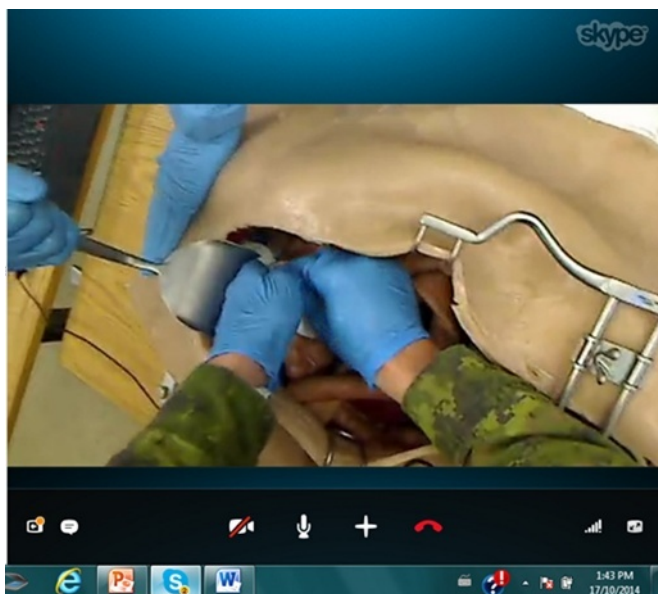
Figure 1. Remote mentor's screen illustrating the surgical simulator as viewed through the MedTechs head-mounted camera.

has been limited progress in developing techniques to control exsanguinating truncal hemorrhage in the pre-medical treatment facility environment, other than admonitions to decrease the time from point of injury to surgical intervention. 1